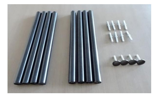
Tubes x 8 Double end stud x 8 Button head bolt x 4