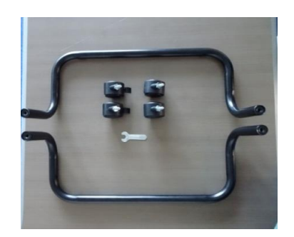
Base x 2 Casters x 4 Wrench x 1