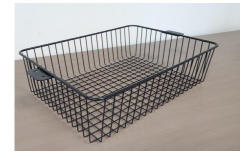
Baskets x 3